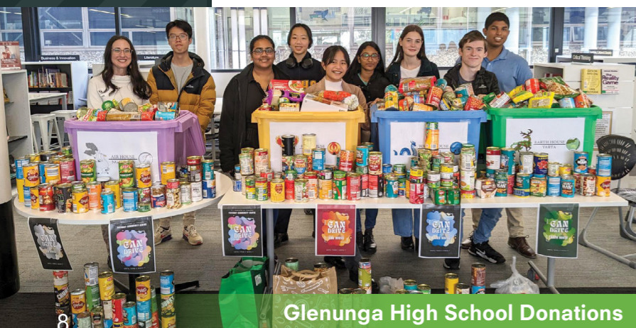
Glenunga High School Donations